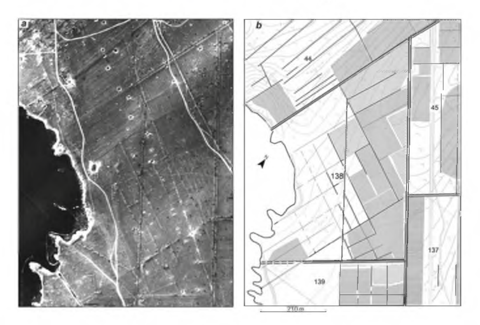
Fig. 2 Block 138: a—aerial photograph of April 23, 1944, from the NARA II collection. GX 1893 sd2/994; b—a drawing of the internal land division of block 138 against the background of the relief of the terrain

Moreover, the examination of the aerial photos of the 1940s allowed archaeologists to conclude that, according to the 'initial' grid, the land was divided before the construction of the fortifications on the isthmus of the Mayachnyy Peninsula on its south-eastern side and at the joint of the Mayachnyy and Sredinnyy peninsulas (Fig. 2a, b). Here, we see a critical difference between the orientations of the borders of blocks nos. 42, 44, 43, 43a, and 138, and the other vast territory of the Herakleian Peninsula.