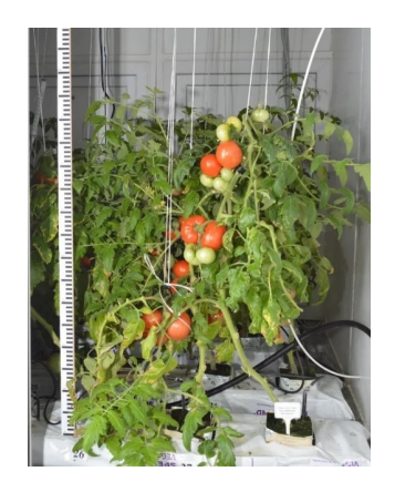
Figure 1. Vegetation climate chamber

During the experiment, the following conditions were maintained in the chamber: the temperature mode was maintained within the range of 24 - 26 °C during the day and at night within 14 - 16 °C with 14 hour daylight hours and a relative humidity of 60 - 65 %. The watering cycle increased as the plants grew from 3 times a day (the phase of seed germination before the formation of fruits) to 5 times a day (the stage of pouring the fruits to full ripeness) for 60 seconds. Two sodium tubular lamps (DNAT-600, yellow color) and one metal halide lamp (DRI-600/4K, white color) were used as a light source. Illumination was 13/900 lux, photosynthetic active radiation - 165 mmol·m<sup>-2</sup>·sec<sup>-1</sup>, radiation density - 36/500 mW·m<sup>-2</sup>.