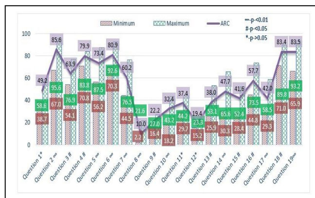
Figure 1. Maximum, average, and minimum levels of complete answers to individual items of the questionnaire in different centers (%)

The summary data on the levels of correct answers to all questions of the questionnaire are presented in figure 1.