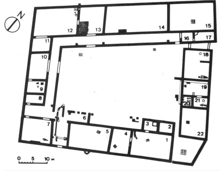
Fig. 1 Plan of the villa rustica in the Obelia residential district, Sofia, Bulgaria (after Magdalina Stancheva 1981)

Raycheva 2017, 437). It is quite possible that there are more villas around Serdica which still remain undiscovered.