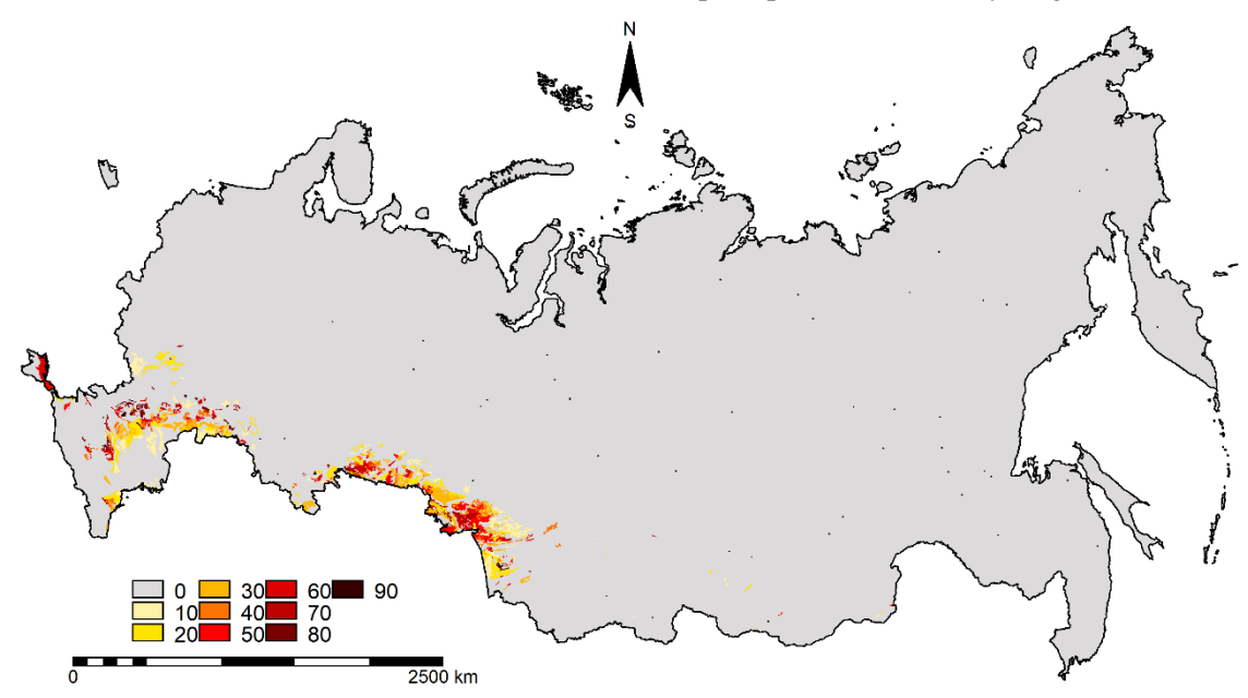
Figure 2. Map of secondary sodification of soils in Russia (percent from soil mapping unit).

Turning to the characteristic of secondary sodification of soils in Russia, we emphasize once again that this group of processes has a much higher prevalence here than secondary salinization, in contrast to the global trend, and also has the features of a pronounced latitudinal zonality, corresponding with the geochemical differentiation of sediments within the European part of the country (Figure 2).