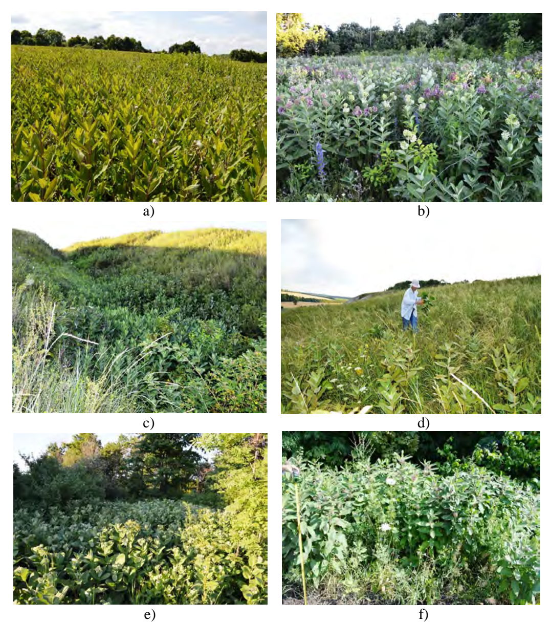
Figure 1. Cenopopulations A. syriaca in various habitats (Stationary "Kulma", Novy Oskol urban district, Belgorod region) a) CP 1, b) CP 2, c) CP 3, d) CP 4, e) CP 5, f) CP 6

The main observations and records were made during the bearing phase.