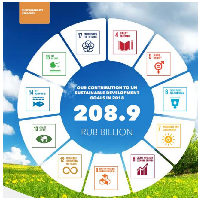
Fig. 2. Contribution of PJSC Lukoil to the SDGs, from The 2018 Sustainability Report” [LUKOIL group report on sustainable development activities for 2018].

The active position of the above companies in the field of sustainable development is understandable in view of the specific nature of their business.