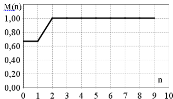
Fig. 2. The dependence of the value of the functional M(n) (46) on the number n of the Legendre polynomials P_n(t) in the solution x(t) (47) for the case S_0 = 1

Figure 2 shows the behavior of the functional value of M (47) depending on the number of polynomials in the solution x(t) (48) for S_0 = 1 . It can be seen that when k > 2 no functional change its value remains constant. This result is due to the finite number of polynomials P_n(t) in the expansion of c(t) (40).