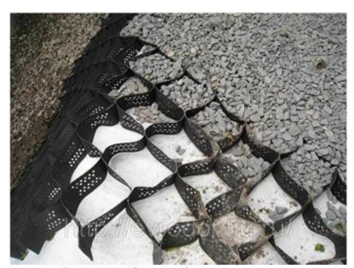
Fig. 5. Plastic geogrids of low pressure Puc. 5. Полиэтиленовая георешетка низкого давления

The fourth part of the route of the hiking trail. It starts from the first observation