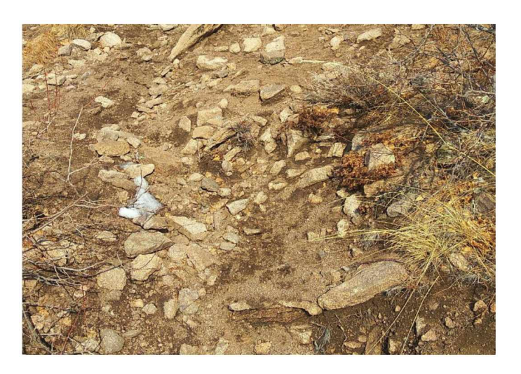
Fig. 2. The mineral part of soil of the hiking trail Puc. 2. Минеральная часть почвы на тропе

The starting point of the ascent of Shara-Tebseg Mountain mostly consists of mineral parts of soil and presents rock particles of different sizes (fig. 2).