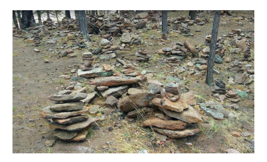
Fig. 1. «Turs» – artificial structures in the form of pyramids on the area of "Mertiskaya krepost" ("The Merkit fortress") Рис. 1. «Туры» – искусственные сооружения в форме пирамид на территории «Меркитской крепости»

The picture below demonstrates the signs of forest environment degradation. At least 20 per cent of the relic apricot trees located closely to the hiking trail have mechanical damages. On the hiking trail directly, there is an absence of new growth, undergrowth and mosses. Speaking about the edges of the hiking trail, here a slight amount of under-