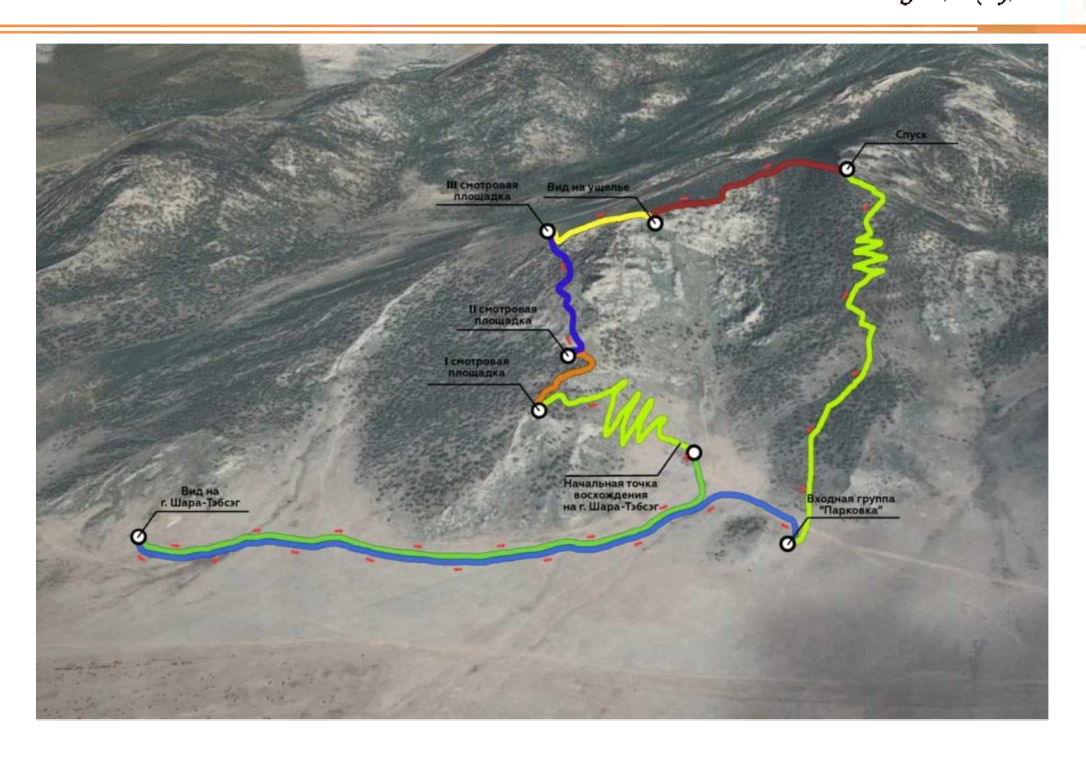
Fig. 3. A quick-map of the route of the ecological hiking trail "Merkitskaya Krepost" Рис. 3. Карта-схема маршрута пешеходной экологической тропы «Меркитская крепость»

The second part of the route of the hiking trail. This starts from the view on Shara-Tebseg Mountain and goes down to the starting point of ascent onto Shara-Tebseg Mountain. The length is 1040 meters. The given part of the route has self-built structures such as an awning with benches and a bonfire site. On the opposite side from the awning there are two wooden public conveniences.