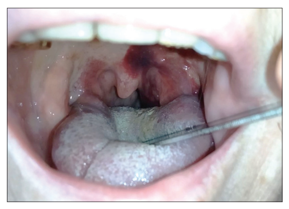
Figure 1: The post puncture pharyngoscopic view of the paratonsillar area on the left

In the clinical observation described by us, a 67-yearold patient had a partially thrombosed fusiform aneurysm of large ICA->25 mm in diameter. According to literary sources, fusiform aneurysms develop most