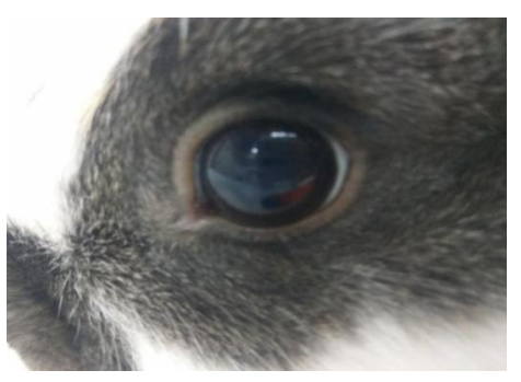
Figure-2: Controlled eye of the rabbit after instillation of Furacilin, concentrate for preparation of solution for local and external use 20 mg/ml, 72 hours after the instillation