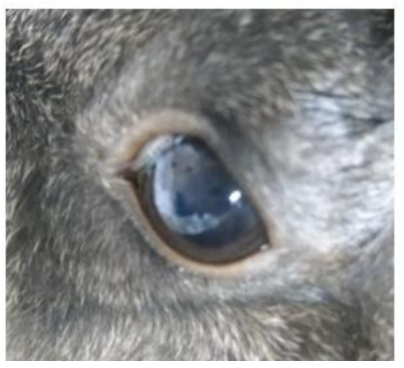
Figure-1: Controled eye of the rabbit, after instillation of Furacilin, concentrate for preparation of solution for local and external use 4 mg/ml, 72 hours after the instillation

The studies showed that after instillation of 0.02% solutions of the studied preparations with a volume of 0.1 ml to rabbits, and subsequent observation after 1, 24, 48 and 72 hours of changes in the conjunctiva, cornea and iris, chemosis was not registered. The number of points in all parameters in all experimental groups did not exceed 0 points (table 1, Annex 2). The state of the controled eyes in all experimental groups was unchanged and corresponded to the state of intact eyes.