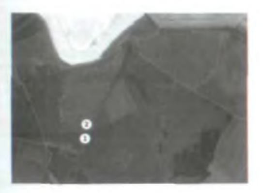
Fig.1. Position of soil sections on the space image of the study area

and arable land near the border of the reserve (arable chernozem, section 2). The scheme of the placement of soil sections is shown in Figure 1. Section 2 is 50 m closer to technogenic objects, so it could be expected that the soil pollution on the arable land thould be either equal or higher than on the virgin site, depending on the wind direction.